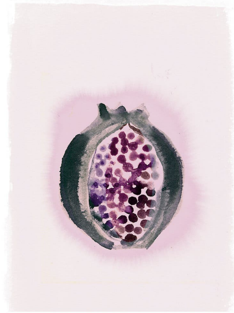
Illustration by Aurore de la Morinerie

Jade and jasper pomegranate, date unknown. “The forbidden fruit in the Garden of Eden wasn’t actually an apple — it was a pomegranate. It’s my favorite fruit. My husband gave me this one.”