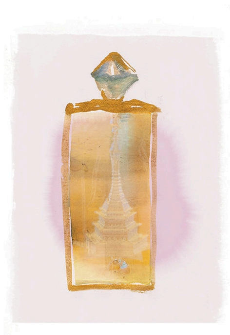
Illustration by Aurore de la Morinerie

Jade and jasper pomegranate, date unknown. “The forbidden fruit in the Garden of Eden wasn’t actually an apple — it was a pomegranate. It’s my favorite fruit. My husband gave me this one.”