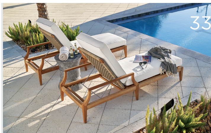
Universal's Coastal Living Outdoor collection featured in Natural Groove

Designers Today , (ISSN 2643-0185) (USPS 22030), Vol. 2/No. 8, Copyright © 2020 by BridgeTower Media LLC, is published monthly except for February, June, August and December by Progressive Business Media, 7025 Albert Pick Road Suite 200, Greensboro, NC 27409. Business, Editorial, Accounting, and Circulation Offices: 7025 Albert Pick Road Suite 200, Greensboro, N.C. 27409. Call 818-487-2027 to subscribe. Periodicals Postage paid at Greensboro, N.C. 27409, and additional mailing offices. POSTMASTER: Send address changes to Designers Today , P.O. Box 16659, North Hollywood, CA 91615.