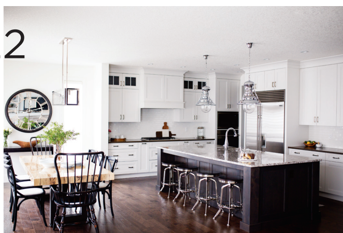
Design by ADM Interiors.