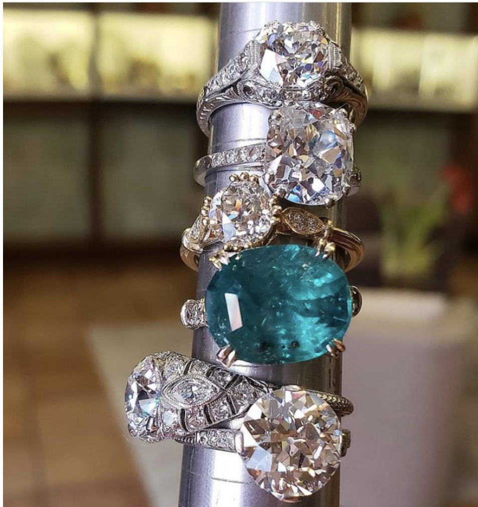
Gray & Davis mix of different centuries of engagement rings

London-based @bentley_skinner is a popular stop to see where Downtown Abbey's costume designer borrowed the cast's tiaras for the series and the film. In business since 1880 and in the same family for three generations, the shop was first invited to supply jewelry to the Royal Family in the latter years of Queen Victoria's reign. Bentley & Skinner still holds the title Jewellers by Royal Appointment to both Her Majesty the Queen and His Royal Highness the Prince of Wales. These diamond Edwardian pendant earrings, circa 1900, are a spectacular example of the shop and website's unwavering commitment to excellence in centuries of jewelry.