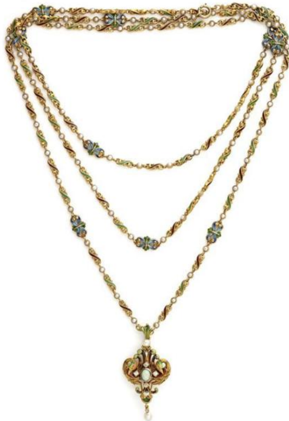
Wartski Lucien Falize necklace 19th century WARTSKI