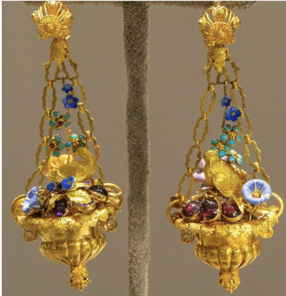
Fred Leighton Victorian Flower basket earrings FRED LEIGHTON

Manhattan based @estatediamondjewelry features a wide range of engagement rings, most predominately from the Edwardian/Belle Epoque and Art Deco periods. The company also has a range of signed jewelry from the 1920s through 1970s as well as a beautiful selection of Art Deco line and bangle bracelets. This jaw dropping 4.53-carat antique engagement ring is with its spit diamond shank is one that once you see you won't be able to get out of your mind if you are shopping for engagement rings.