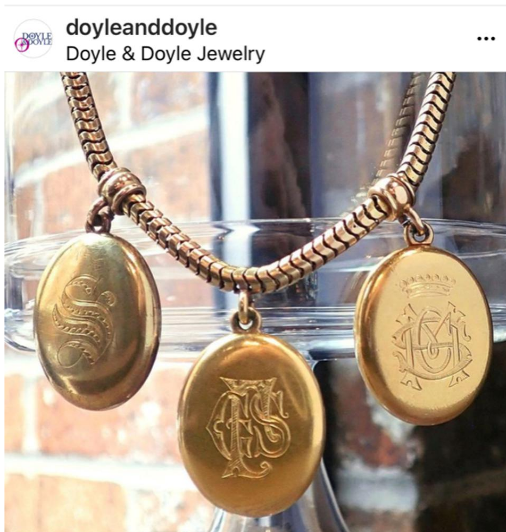
Doyle & Doyle Victorian three locket necklace with engraved monograms DOYLE & DOYLE

Manhattan-based @doyleanddoyle's website is a veritable jewelry box of different styles that satisfy a range of demographics and customers. Emphasis is on jewelry that is wearable and that won't be tucked away in a safe with many styles hailing from the Victorian period. When it comes to engagement rings, they range from Victorian to mid-20 th century and there are also a wide variety of different periods of yellow gold chased and engraved wedding as well as different styles of eternity bands that are part of the ever evolving online shop.