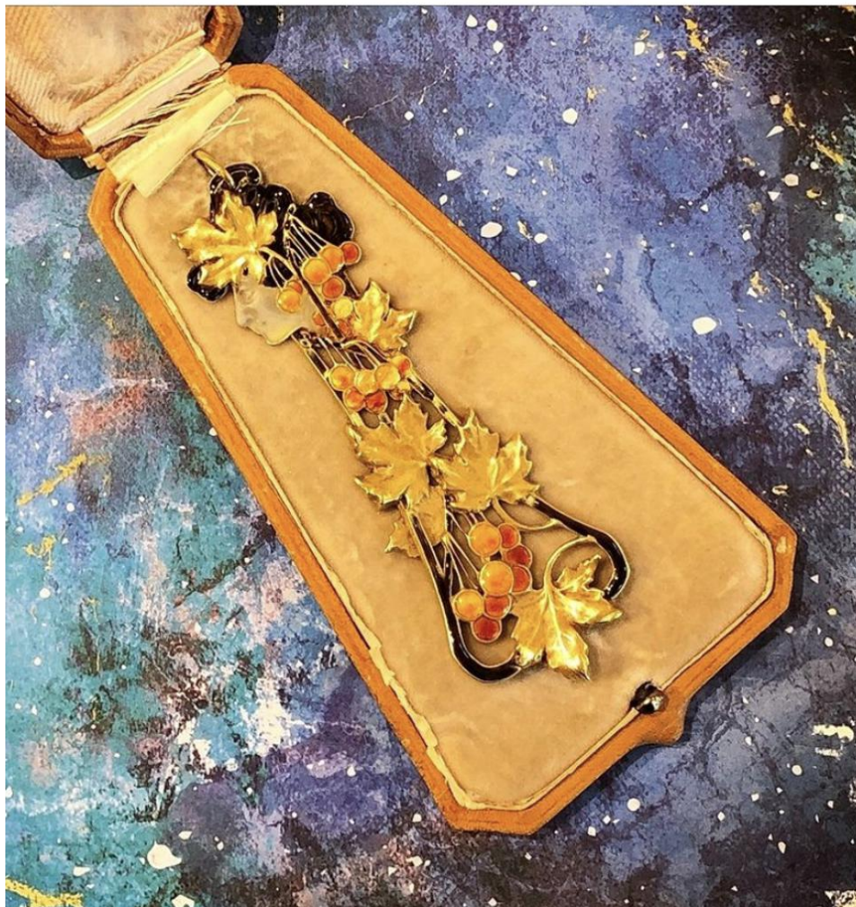
Macklowe Gallery Lalique Pendant MACKLOWE GALLERY