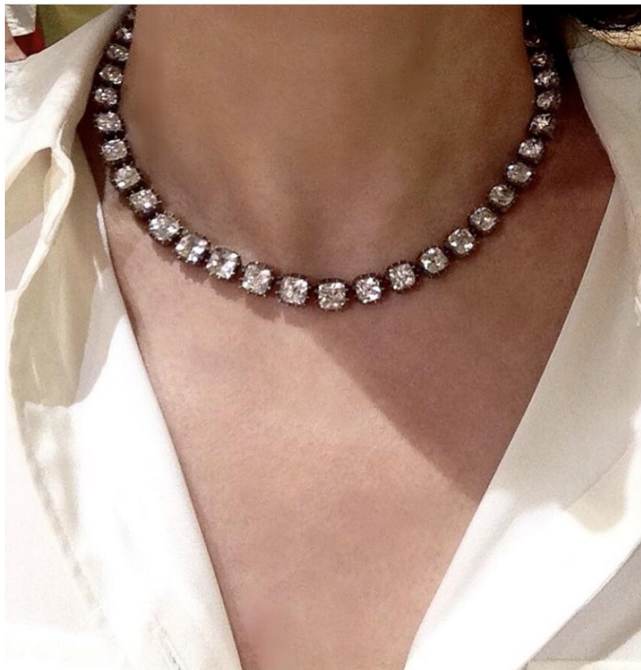
Spare Room Antiques Rock Crystal rivière SPARE ROOM ANTIQUES