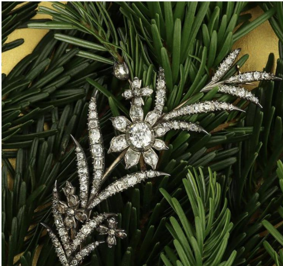
Berganza London Georgian Brooch BERGANZA