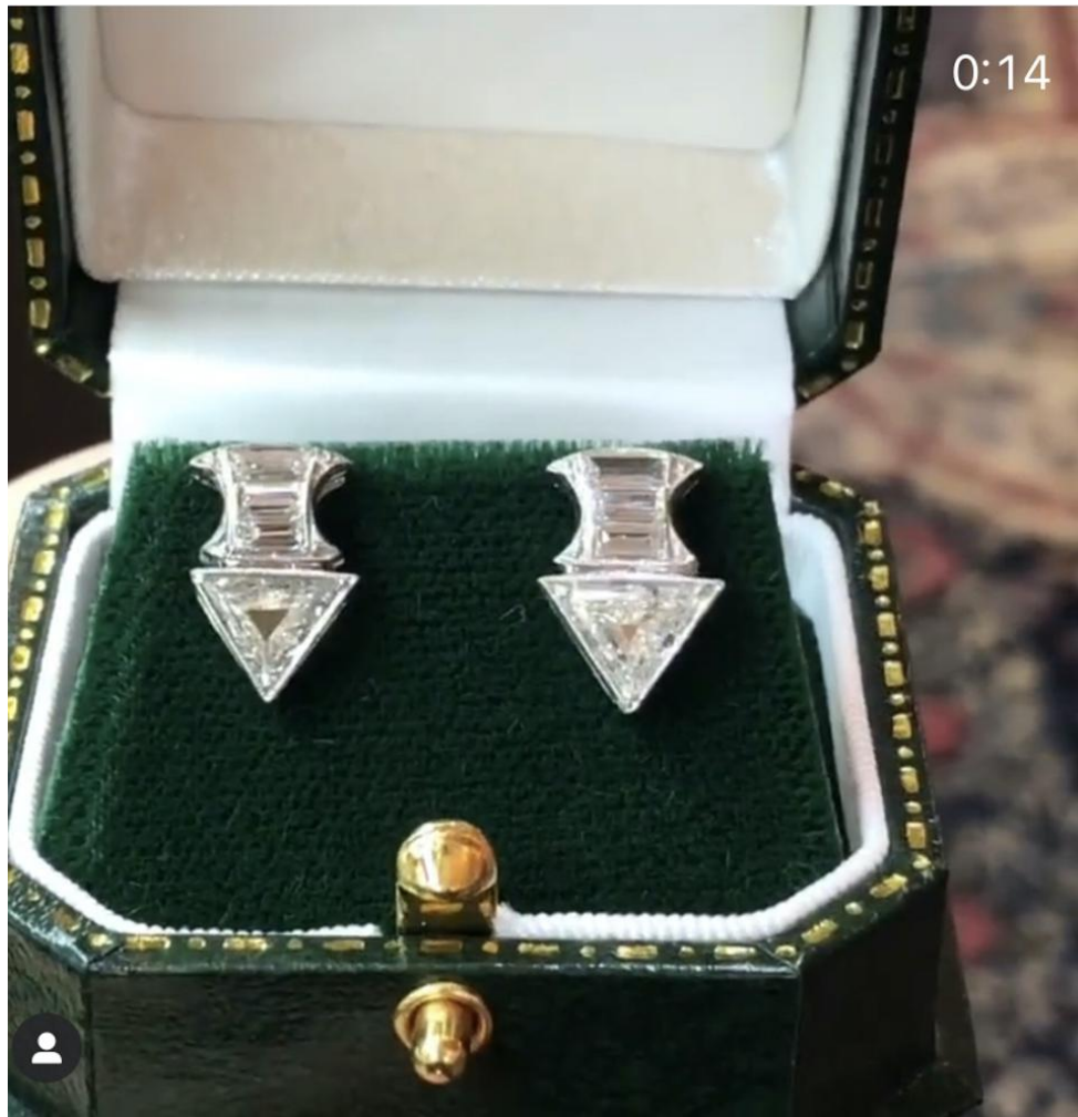
Platt Boutique Art Deco earrings PLATT BOUTIQUE