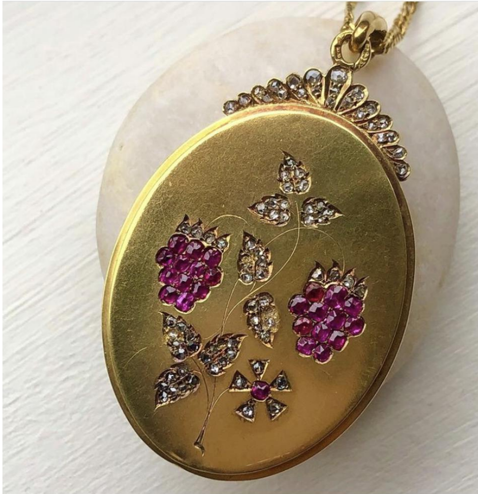
Keyamour Grape and leaf locket KEYAMOUR

Manhattan-based @Leightonjewels ' (Fred Leighton) selection comprises what antique dreams are made of. Rebecca Selva not only curates an amazing array of jewelry but she's a born stylist with a strong design sense and creativity that is unparalleled when it comes to mixing up different centuries in layers of necklaces, or scattered brooches. She also knows an awe-inspiring find when she sees one such as these enamel and gold flower basket earrings with bird perched on top of them.