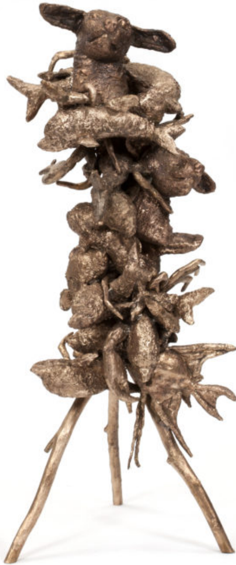
The Noah candlestick, in bronze, 2017.