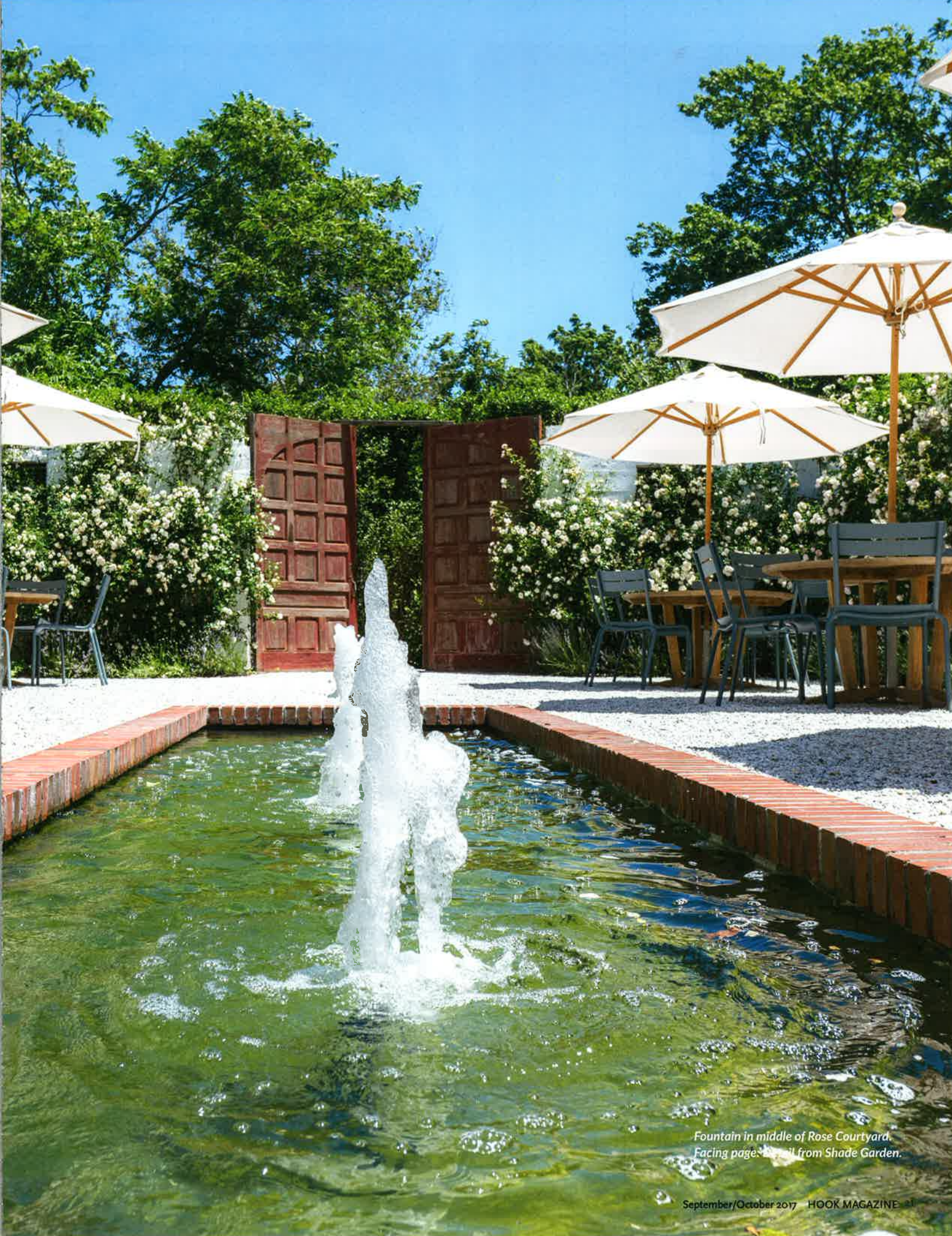
Fountain in middle of Rose Courtyard. Facing page: Tunnel from Shade Garden.