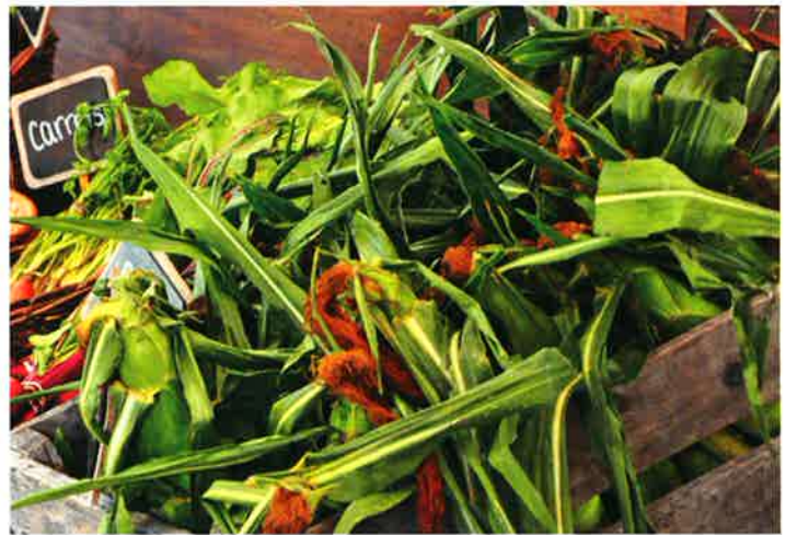
Above, clockwise: Detail from Rose Courtyard; Citroen Valley Rock Inn food truck; Fresh, organic produce in Blue Barn Farm Stand; Detail from Shade Garden.

anchor for his enterprise. To preserve a threatened sustainable way of life, he has purchased Orange County farmland to help ensure the livelihood of our next generation of farmers, and to preserve farmland. Once-ramshackle sheds are now airy structures with chestnut-brown exposed beams. They house a new farm stand, a Garden Grill (serving 7 days a week) and a coffee house and juice bar.