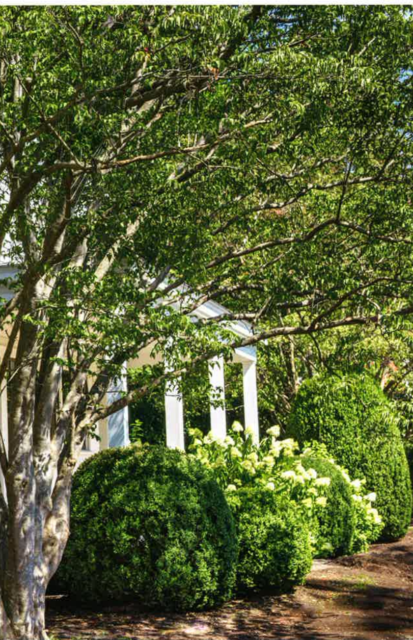
Bedroom interior of guest room designed by Lisa Bowles; Exterior of newly renovated Valley Rock Inn guest house; Detail from landscaped garden outside Valley Rock Inn guest house. Facing page: Customers eyeing produce at the Blue Barn Farm Stand; Exterior of the Blue Barn Farm Stand.

plan to revitalize the area, and has appeal for everyone, especially city-dwellers who want to get away from it all, but not that far away. Just one hour by train from New York City, it is a stone's throw from the Sloatsburg train station, a perfect jumping off point to the miles of bike and hiking trails in Harriman State Park.