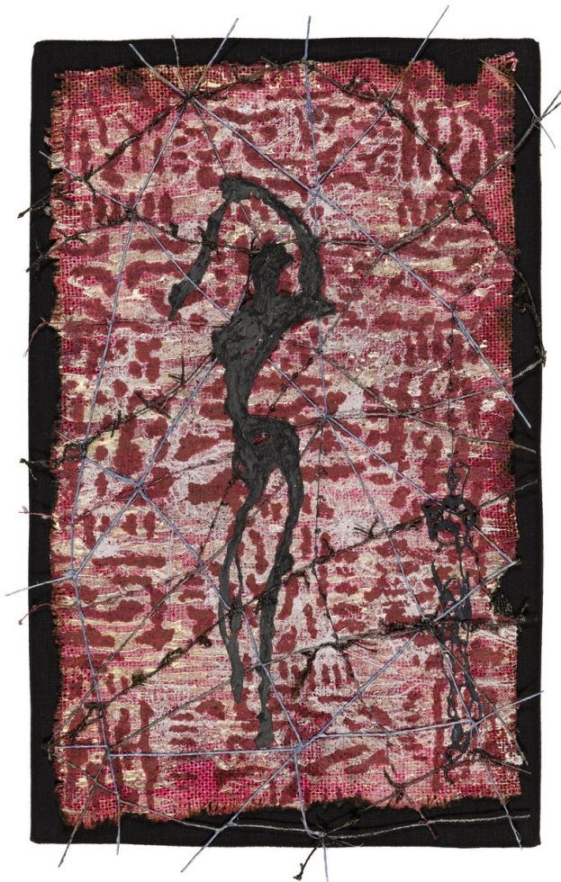
Lifeline 6 by Mary Fisher.

"For some folks, activism is what they've chosen to do, but that wasn't and isn't my experience," Fisher, who was diagnosed as HIV-positive in 1991, says. "My activism is an expression of who I am beginning as a woman and a woman with AIDS. When I've produced a book or given a speech or produced a sculpture, I've always tried to make it a truthful reflection of who I am, and I think most artists do while they're working. Whether or not it's activism, I think it reflects who we are, what we are and how we feel."